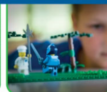
Stop Motion Animation